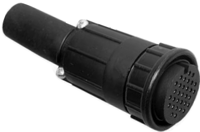
Cable Socket 23X8X-XXSG-XXX Matching Mate: • Panel 24XXX-XXPG-XXX